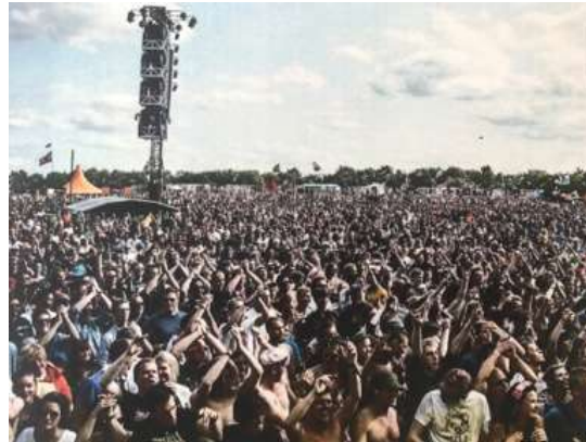
Lot's of possibilities